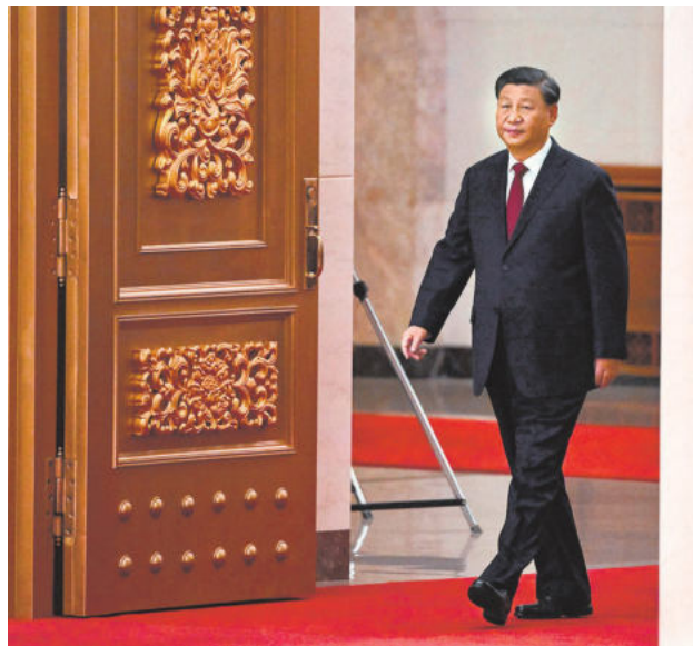
Tall figure: Xi Jinping arriving to introduce members of the CPC's new Politburo Standing Committee in Beijing on Saturday.

As the highest ranking Vice Chairman, General Zhang will be Mr. Xi's right-hand man in the PLA, which has seen sweeping reforms since 2016, when Mr. Xi disbanded the Soviet-style general staff de-