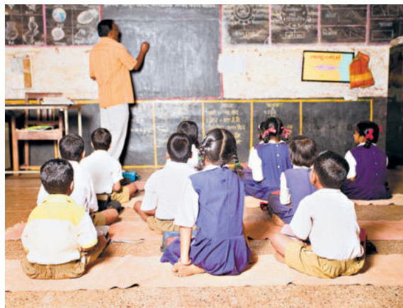
Novel ways: The NCF favours an interactive curriculum using story-telling techniques.