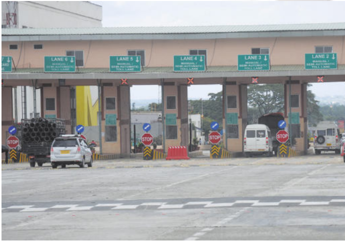
Money spinner: In India, toll collections or transmission fees make up the InvIT's distributable cash flows.