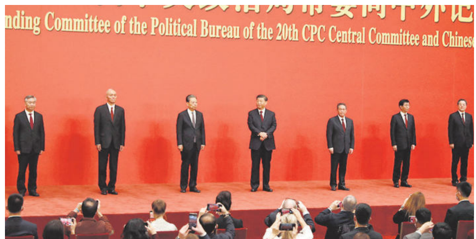
New team: Chinese President Xi Jinping (centre) introducing the Politburo Standing Committee members to the media on Sunday.

With two other allies continuing on the PBSC, this marks an unprecedented sweep of all seven positions on the all-powerful body, a first in Chinese Communist Party politics